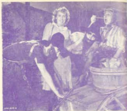
Stone from "There's a Hole in the Old Oaken Bucket" from Hillbilly Package

SDRU 200815 — MOUNTAIN MUSIC PACKAGE, containing twelve used 100' R-I Sound Musical Films, is priced at $13.95