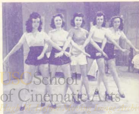
Scene from "Bend Down, Sister" in Cuties of the Chorus Package

# SDU 2088 — GIRLS, GIRLS, GIRLS PACKAGE, containing twelve used 100' R-I Sound Musical Films, is priced at $13.95