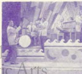
11M1 — CONTRAST IN RHYTHM

School of Cinematic Arts Hugh M. Hefner Moving Image Archive