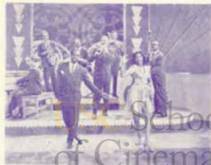
20M3 — COUNT ME OUT