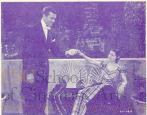
Scene from "I Knew It Would Be This Way" from Sweet and Sentimental Package