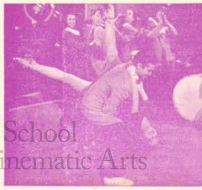
Scene from "Ozzie Nelson Blues" from Flying Feet Pack