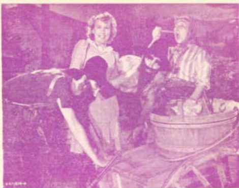
Scene from "There's a Hole in the Old Oaken Bucket" from Hillbilly Package

© SDRU 200814 — KORNUT-UPS PACKAGE, containing three used 100' R-I Sound Musical Films, is priced at $5.95