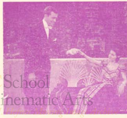
Scene from "I Knew It Would Be This Way" from Sweet Sentimental Package

© SDRU 200827 — WESTERN PACKAGE, containing twelve used 100' R-I Sound Musical Films, is priced at..... $