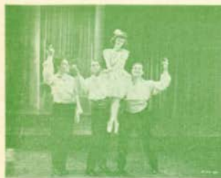
2704 - BALLET DANCER'S NIGHTMARE