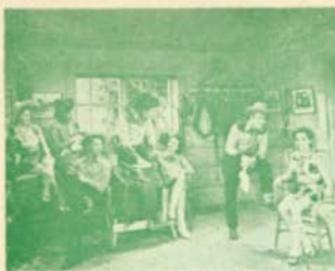
8506 - BACK IN THE SADDLE AGAIN from "COWPOKE"