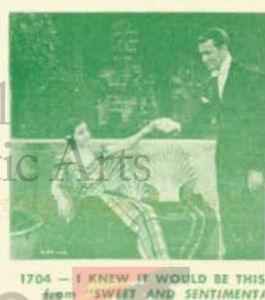
1704 - I KNEW IT WOULD BE THIS from "SWEET AND SENTIMENTAL"