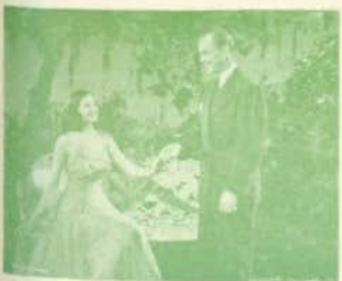
3107 — MAGIC OF MAGNOLIAS from "WALTZ TIME"