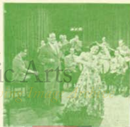
5102 - YOU MADE ME LOVE YOU

ALL FILMS LISTED ON THIS PAGE ARE GOOD USED REVERSE-IMAGE 16mm. SOUND P