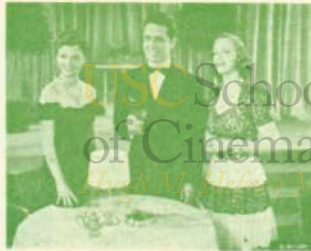
1116 - A SONG AND A DANCE