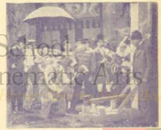
907 - WHEN THE CIRCUS COMES TO TOWN from "CHUCKLES"