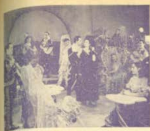
11002 - DARK VELVET NIGHT from "SULTRY SENORITAS"