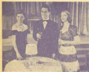
1716 — A SONG AND A DANCE