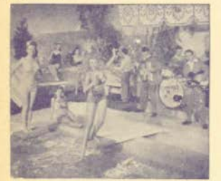
9601 - FIVE FEET TWO FROM "GIRLS, GIRLS, GIRLS"