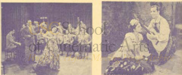
5102 — YOU MADE ME LOVE YOU