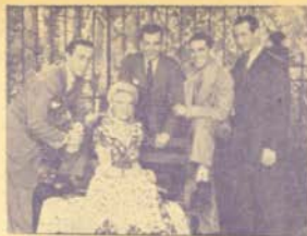
10105 - THAT'S THE MOON