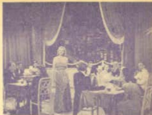
3503—YOU APPEAL TO ME