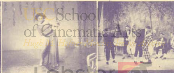
14905 — SWING CATS BALL