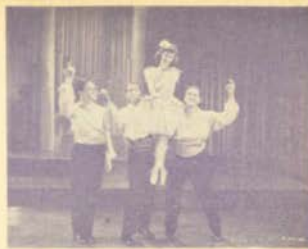
2704—BALLET DANCER'S NIGHTMARE