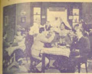
3007—SHE IS MORE TO BE PITIED THAN CENSURED