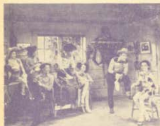
8506 - BACK IN THE SADDLE AGAIN from "COWPOKE"

908 - WHISTLER AND HIS DOG (Alvino Rey); 8803 - BANJOMANIA (Eddie Peabody); 10501 - STRUM FUN (Eddie Peabody)