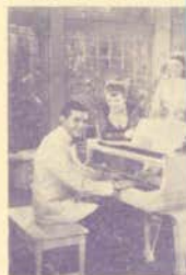
13101 - TWELFTH STREET TUNES"