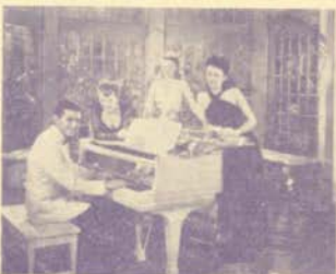
13101—TWELFTH STREET RAG from "TOP TUNES"