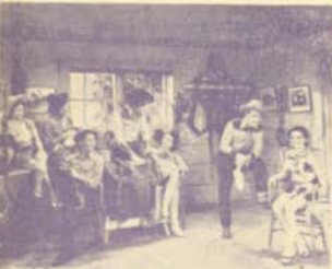
8506—BACK IN THE SADDLE AGAIN from "COWPOKE"

908 - WHISTLER AND HIS DOG (Alvino Rey); 8803 - BANJOMANIA (Eddie Peabody); 10501 - STRUM FUN (Eddie Peabody).