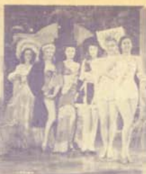
1501—PICKLE PUSS from "GIRLS"