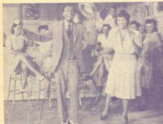
10006 — LEG'S AINT GOOD