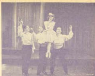
2704-BALLET DANCER'S NIGHTMARE