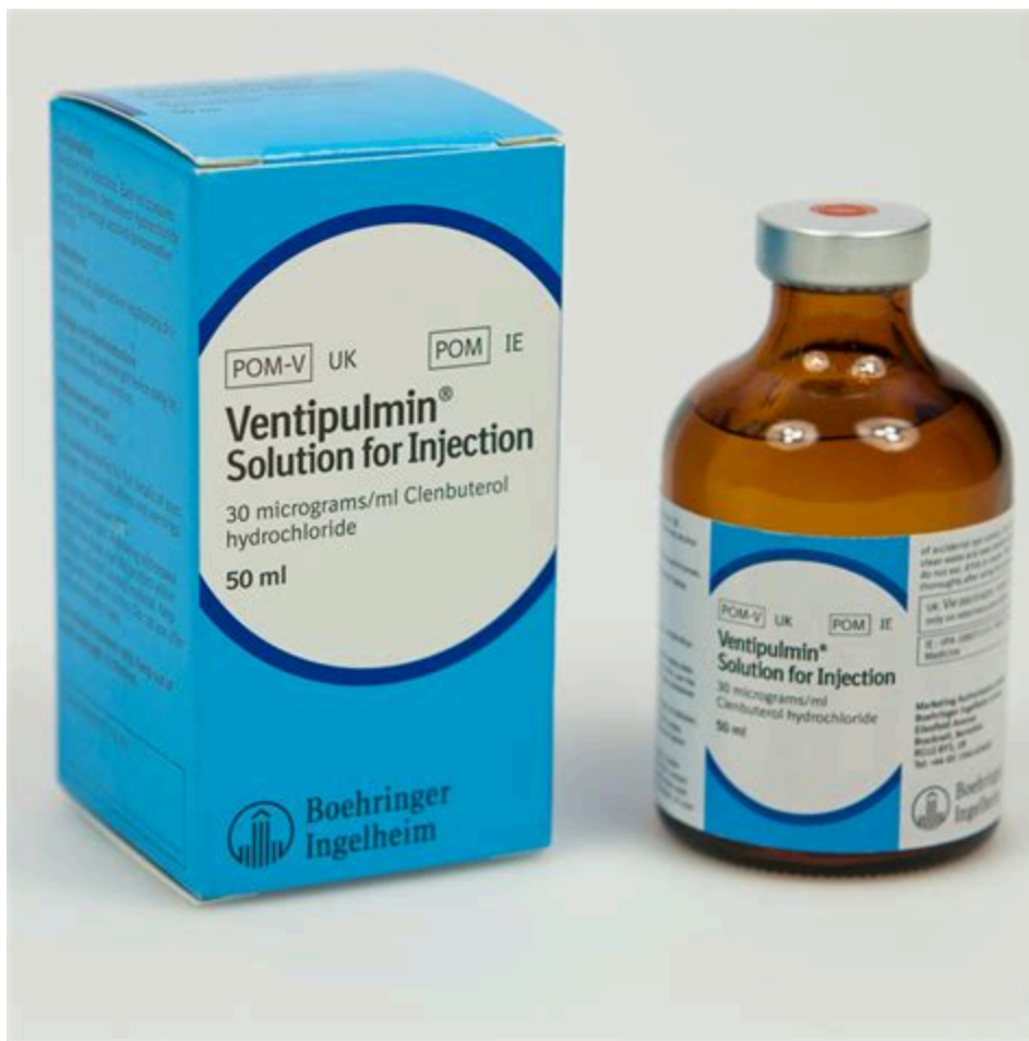
Dianabol 25 Mg Capsules -

Dianabol O Anadrol . Dianabol 25 Mg Capsules - Dianabol O Anadrol . BUY ANABOLICS ONLINE: bit/3hXa6zD . Dianabol 25mg/tab (Dbol)- Fast Muscle Mass Gains. Brands: Sky Pharma. Rated 4.50 out of 5 based on 8 customer ratings. ( 8 customer reviews) $ 125.00 $ 105.00. Dianabol 25mg is also famous as methandienone. Anadrol is far superior than dbol imo. Dbol gives an awesome watery look with a full moon face. Gets you some strength and some fluffy muscles with a uplifting attitude. Anadrol- gives you the same epic strength, less of the full moon face and less of a super watery look while feeling like a beast.