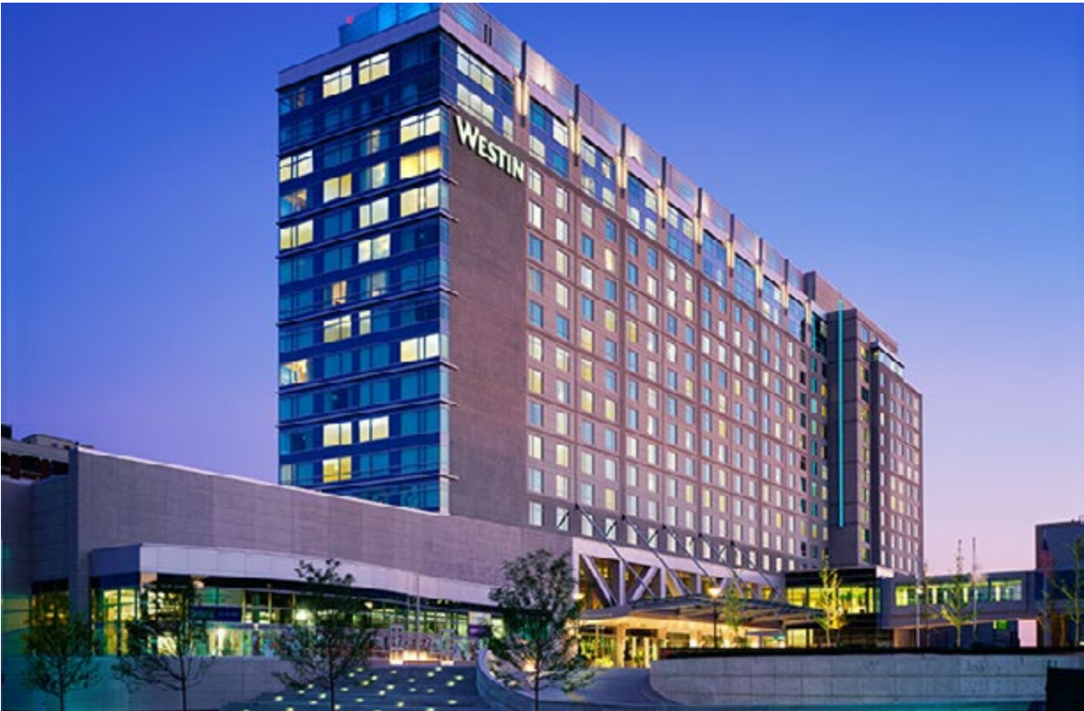
Westin Boston Seaport District 425 Summer Street, Boston, MA 02210

In the event of conflicts regarding booth space requests or conditions beyond the control of the exhibit management, The Protein Society reserves the right to revise, relocate, or reassign exhibit booths at any time for the overall benefit of the Symposium. A revised floor plan will be provided upon request.