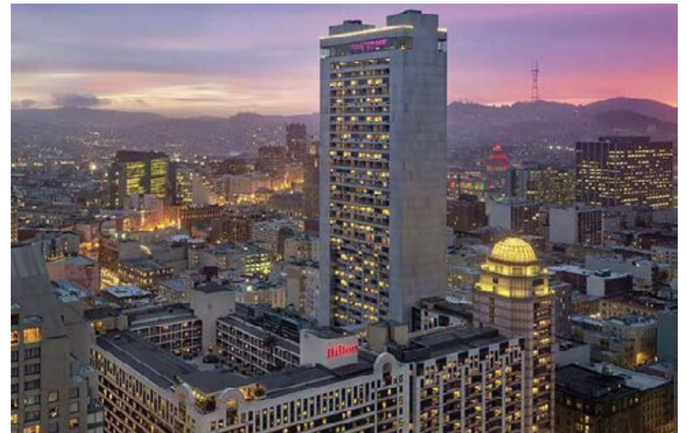
HILTON SAN FRANCISCO UNION SQUARE 333 O'FARRELL ST, SAN FRANCISCO, CA 94102

In the event of conflicts regarding booth space requests or conditions beyond the control of the exhibit management, The Protein Society reserves the right to revise, relocate, or reassign exhibit booths at any time for the overall benefit of the Symposium. A revised floor plan will be provided upon request.