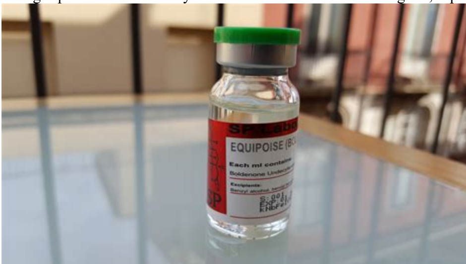
Testosterone propionate is a

As is the case with all testosterones, the propionate version will work in a similar manner. That means, increased strength, stamina, libido and aggression. Testosterone is what makes men, men -- stronger and more muscular than women, with less fat. It also is what makes men lose their hair, causes oily skin and enlarges prostate tissue. But you have to take the bad with the good, especially.