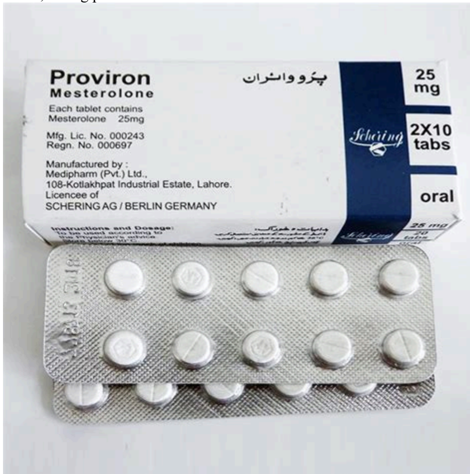
Sustanon 250 Cycle. A

experience additional lean mass; compared to running sustanon 250 by itself. Sustanon is typically run anywhere from ten to fourteen weeks. In the athletic and bodybuilding community, beginners usually dose between 300-500mg per week. Intermediate users will kick it up a notch and inject between 500-700mg per week and the advanced steroid users will often inject between 700-1,000mg per week.