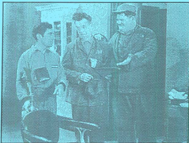
Stan Laurel & Oliver Hardy

Look for this icon next to films that have never before been released by Blackhawk or films that are new versions of previously released classics!