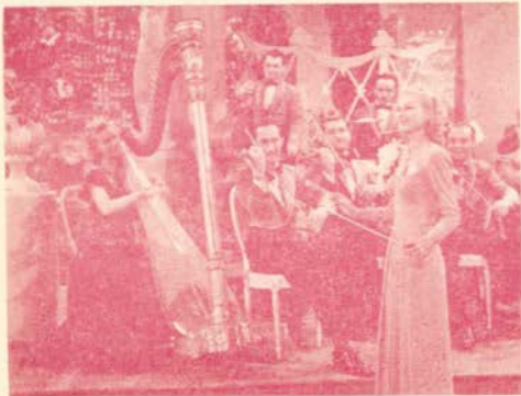
RI-507 LAST NIGHT'S GARDENIAS