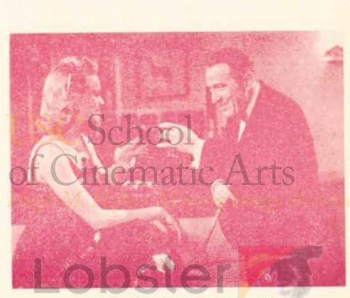
RI-2501 HERE'S LOVE IN YOUR EYE