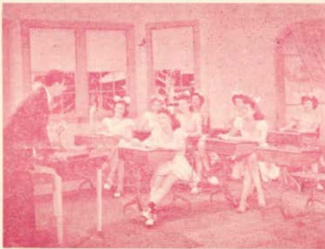
RI-8008 THE ALPHABET SONG