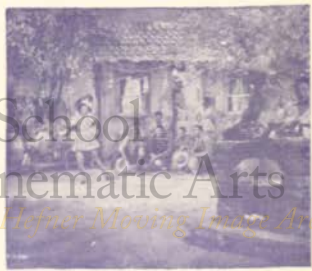
8907 — CARAVAN from "SEPIA CELEBRITIES"

4001 — HONEYUCKLE ROSE (Fats Waller) 4505 — HARK HARK THE LARK (Deep River Boys) 4602 — LAZY BONES (Dorothy Dandridge) 5801 — A ZOOT SUIT (Dorothy Dandridge) 6185 — SKUNK SONG (Cah Calloway) 8907 — CARAVAN (The Mills Brothers) 8908 — HOT IN THE GROOVE (Erskine Hawkins and his Orchestra) 10806 — A HARBESQUEU REVUE (Mahel Merce) 11005 — BARBLING BESS (The Chanticleers) 14708 — DOCK IT FOR ME (Maurice Rocco) 17208 — DINAH (Bob Howard) 21408 — SLEEP KENTUCKY BABE (Day, Dawn and Dusk)