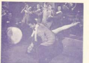
10606 - OZZIE NELSON BLUES from "FLYING FEET"