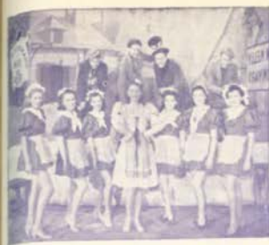
1606 — THERE'LL ALWAYS BE AN IRELAND from "EMERALD ISLE"