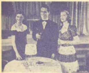
1116 — A SONG AND A DANCE