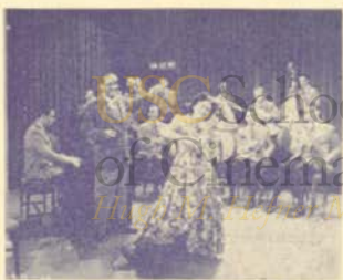
5102 — YOU MADE ME LOVE YOU