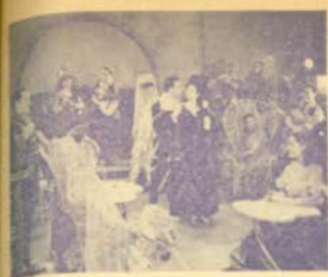
11002 - DARK VELVET NIGHT from "SULTRY SENORITAS"