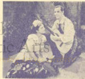
10505 — ANDEE

ALL FILMS LISTED ON THIS PAGE ARE GOOD USED REVERSE-IMAGE 16mm. SOUND PRI