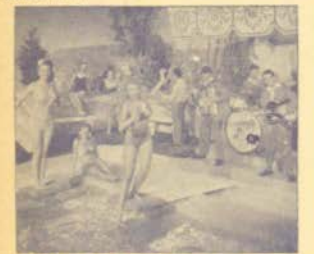
9601 - FIVE FEET TWO FROM "GIRLS, GIRLS, GIRLS"