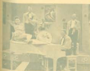
18M2—THE POLLARD JUMP