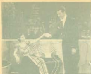
1704 - I KNEW IT WOULD BE THIS WAY