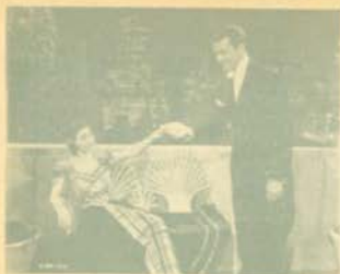
1704 - I KNEW IT WOULD BE THIS WAY