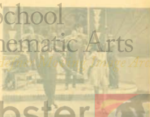
20M3—COUNT ME OUT