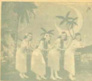
27001 - HULAHUMBA from "GRASS SKIRT"