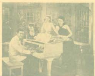
13101 - TWELFTH STREET RAG from "TOP TUNES"