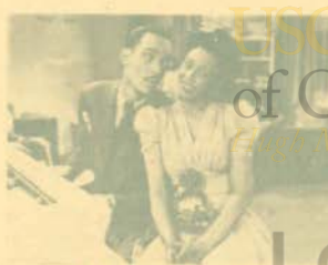
17008—I CAN'T GIVE YOU ANYTHING BUT LOVE