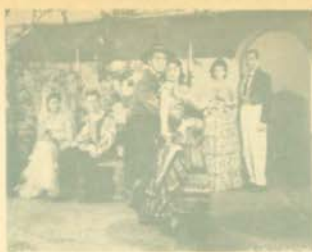
5505 - THE BELLS OF SAN RAQUEL