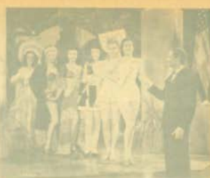
1501 - PICKLE PUSS from "GIRLS, GIRLS, GIRLS"