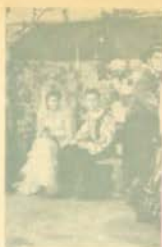
3503 - THE BELLS