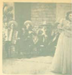
2602 - TI-PI-TIN