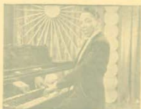
14708 - ROCK IT FOR ME from "SEPIA CELEBRITIES"