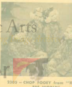
2305 - CHOP FOEY from "THE WORLD"

4001 - HONEYUCKLE ROSE (F. 4406 - TAKE ME BACK, BABY (C. 4503 - HARK HARK THE LARK BOYS); 4002 - LAZY BONES (Donny 6105 - SKUNK SONG (Cab Calloway); CAME O' THE BLUES (Maxine Sullivan); PAPER DOLL (Mills Brothers); 10000 - WUZZY (Lainie Jordan and Buby Rich - PARLON ME, BUT YOU LOO MAIGIE (Three Chets); 14708 - BO ME (Maurice Roche); 89008 - SNOO JO (Delta Rhythm Boys); 19M3 - ER FOR RHYTHM (King Cole Trio)