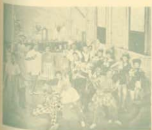
3505 - SUGAR HILL MASQUERADE from "FLYING FEET"