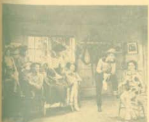
2504 - BACK IN THE SADDLE AGAIN from "COWPOKE"