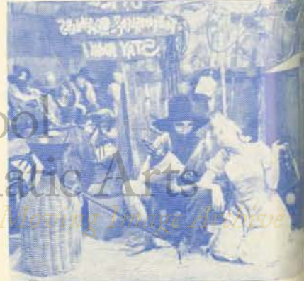
4606 — MOUNTAIN DEW