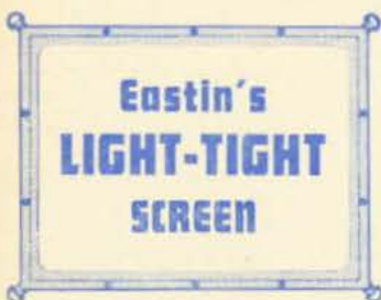
Eastin's LIGHT-TIGHT SCREEN

BELL AND HOWELL Model 120 sound 16mm projector; 12" speaker; suitable for use in the home or with small groups; operates at either sound or silent speed and in reverse; motor rewind. Our item No. 110 ..... $129.95