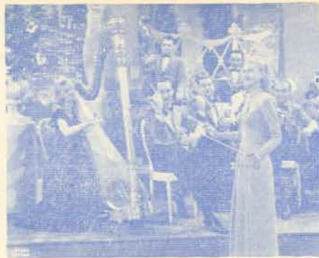
507 - LAST NIGHT'S GARDENIAS