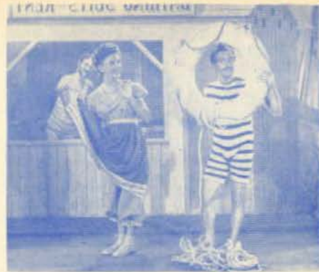
26507 - WHEN YOU AND I WERE YOUNG MAGGIE