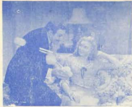
6308 — I DON'T TRUST THE MEN