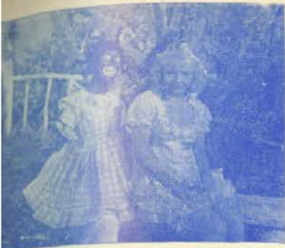
9402 — THE TERMITE LOVE SONG