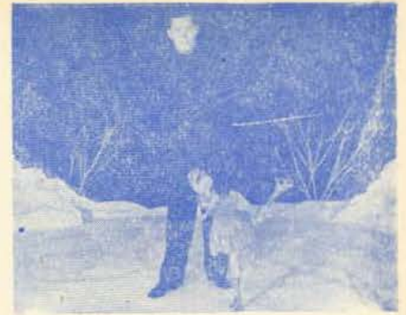
10003 — FAVORITES