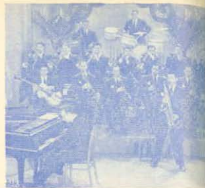
5401 - DOIN' THE RATAMACUE