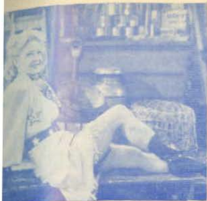
16701 - ELECTION DAY