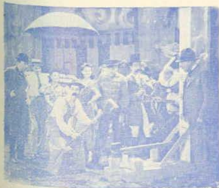
907 — WHEN THE CIRCUS COMES TO TOWN