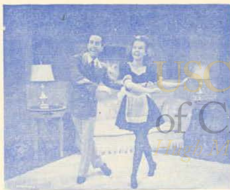
1404 — PENTHOUSE SERENADE