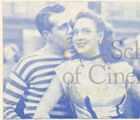
26301 — MOITLE FROM TOITY TOID AND TOID