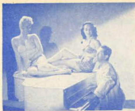
6806 - ST. JAMES INFIRMARY