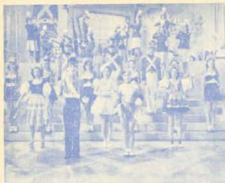
"PARA OF THE WOODEN SOLDIERS" (103)