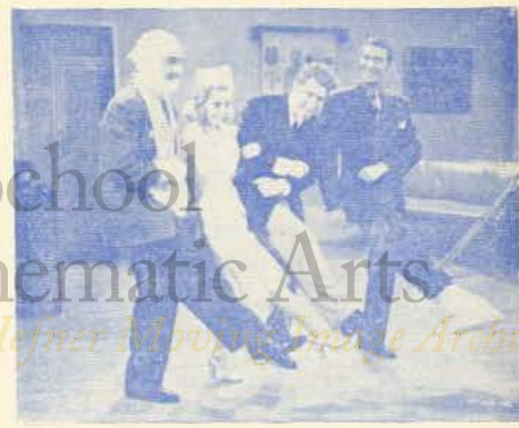
3105 — A LITTLE JIVE IS GOOD FOR YOU

Always Order R-I Musicals by Number and Title