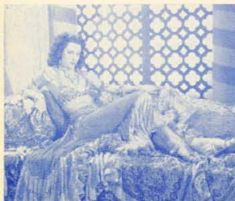
20801 — NAUTCH DANCE