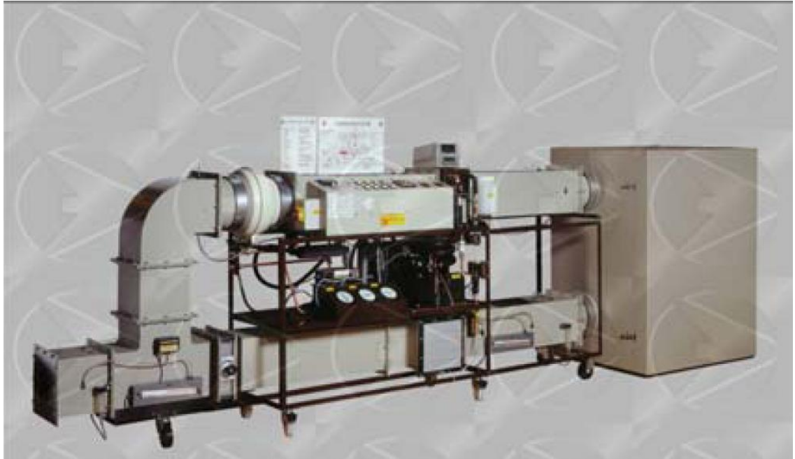
Figure 2 – A660 Apparatus.

P.A. Hilton Air Conditioning Laboratory Unit (A660) - Apparatus for Demonstrating Air Conditioning System