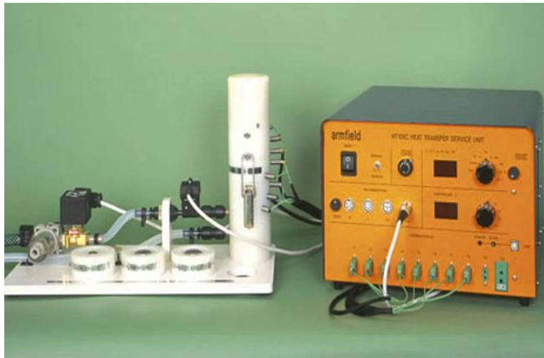
Figure 1 : HT11 Linear Heat Conduction Unit